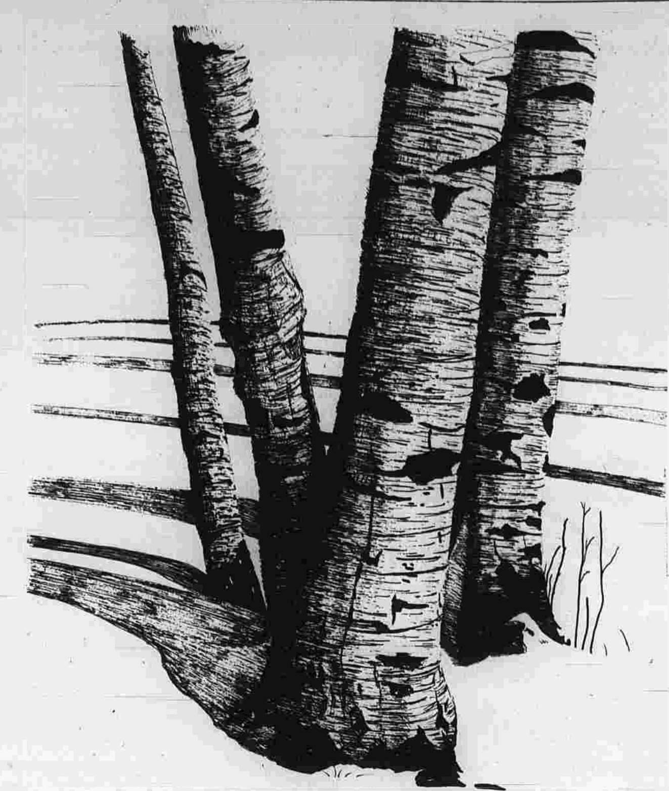
BIRCH CLUMP: PEN AND INK BY BRUCE KINGSBURY Courtesy The Artist

All that has happened is that you-know-who has progressed down the slick, dark road of acknowledged imperfections in our society, fired off another of his motive-pure publicity releases, and knocked himself off another set of headlines.