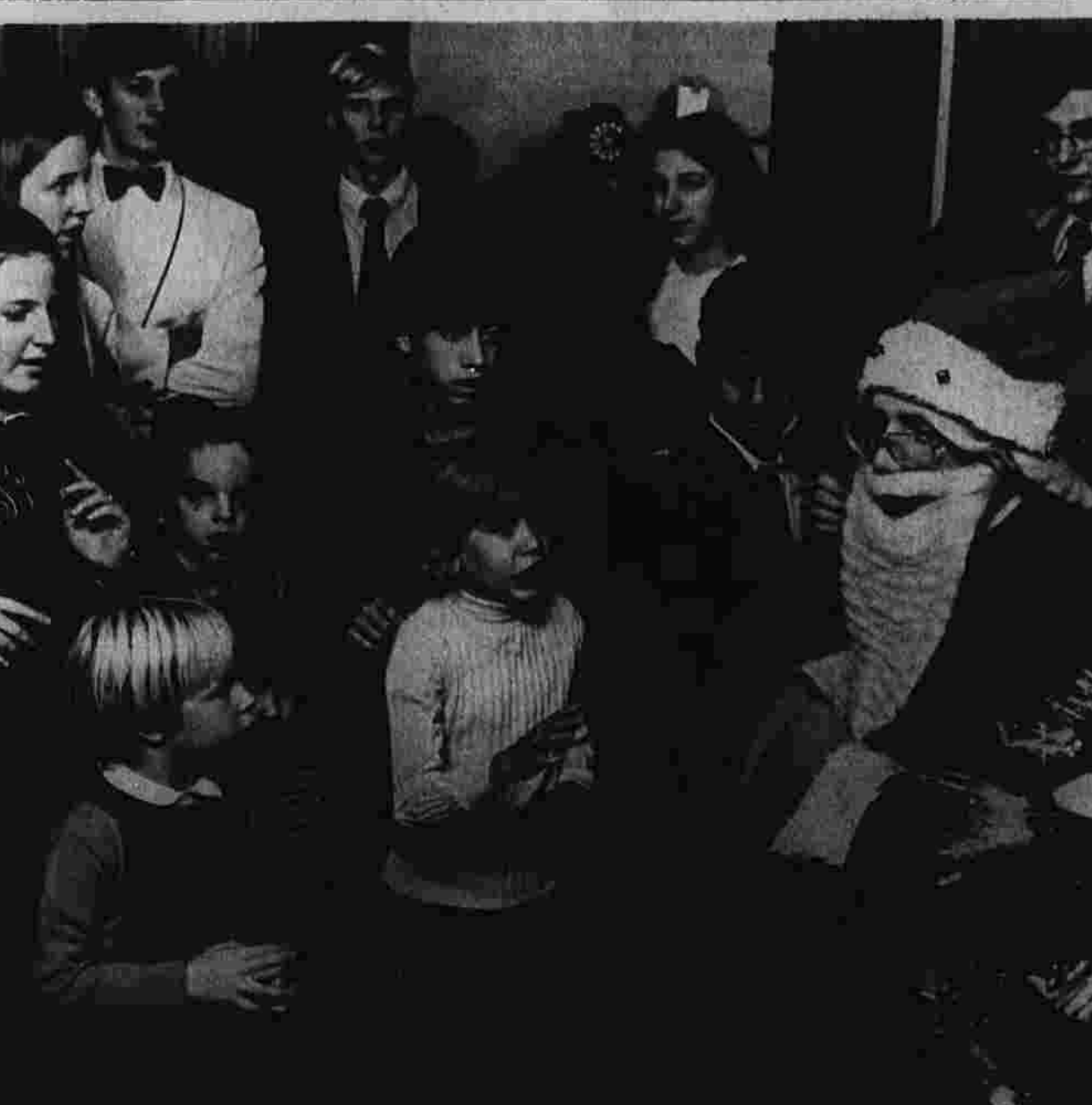
Santa entertains youngsters at the Instructor's of the Handicapped party in the Elk's Lodge.

The Art Department is requesting the addition of a non-mathematical physics course to be integrated along with the present physics course. As part of the department's annual attempt to provide a high student interest subject each year, the department is also asking the board to drop marine biology in favor of offering psychology. Expenses for the psychology course could be minimized by using paperback texts and library resource materials, the proposal notes.