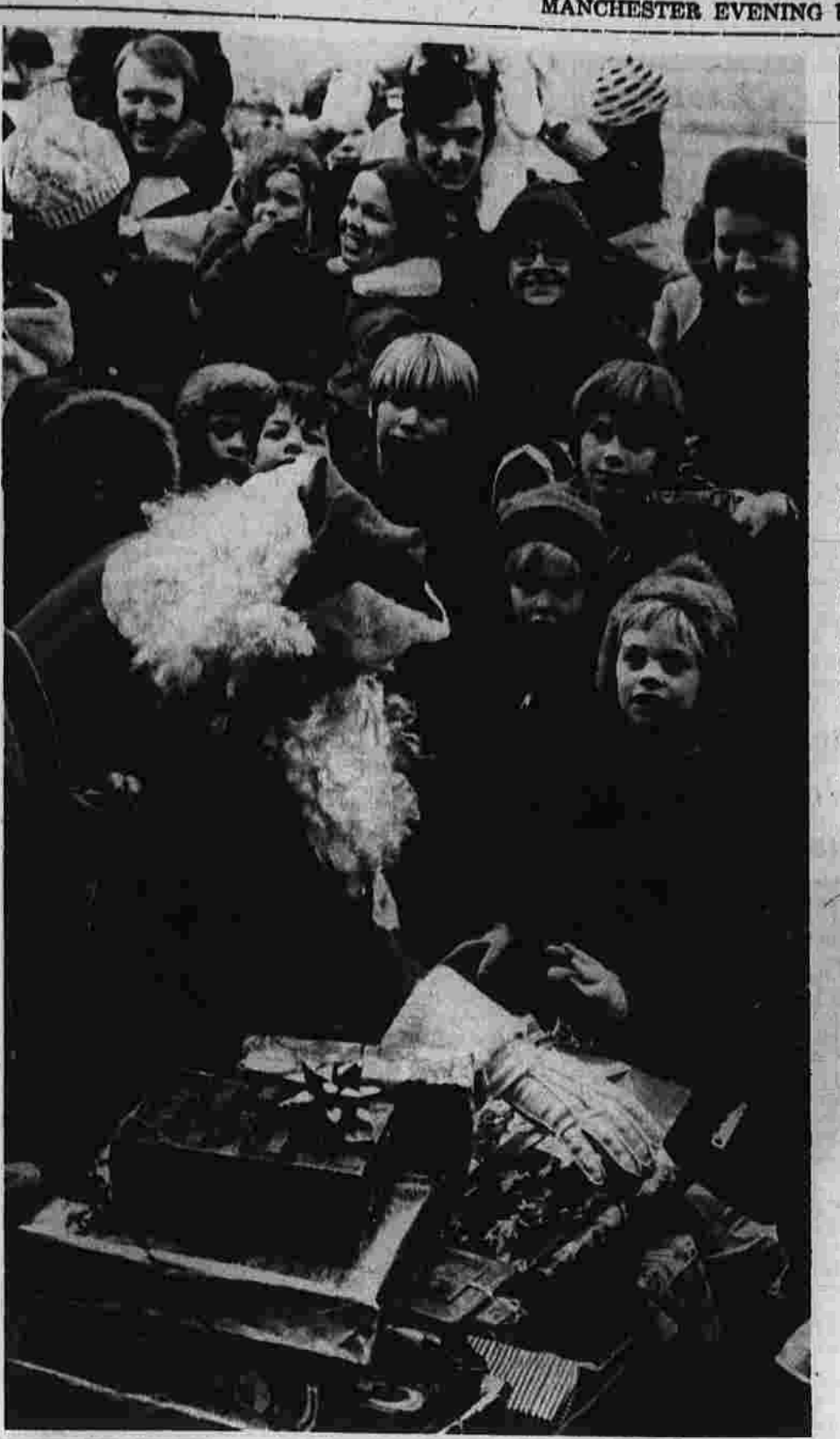
Santa stopping by to visit the folks and hand out gifts at Fountain Village.

Happy is he whom the truth by itself doth teach. If the truth shall have made you free, then shall not care for the vain words of men."